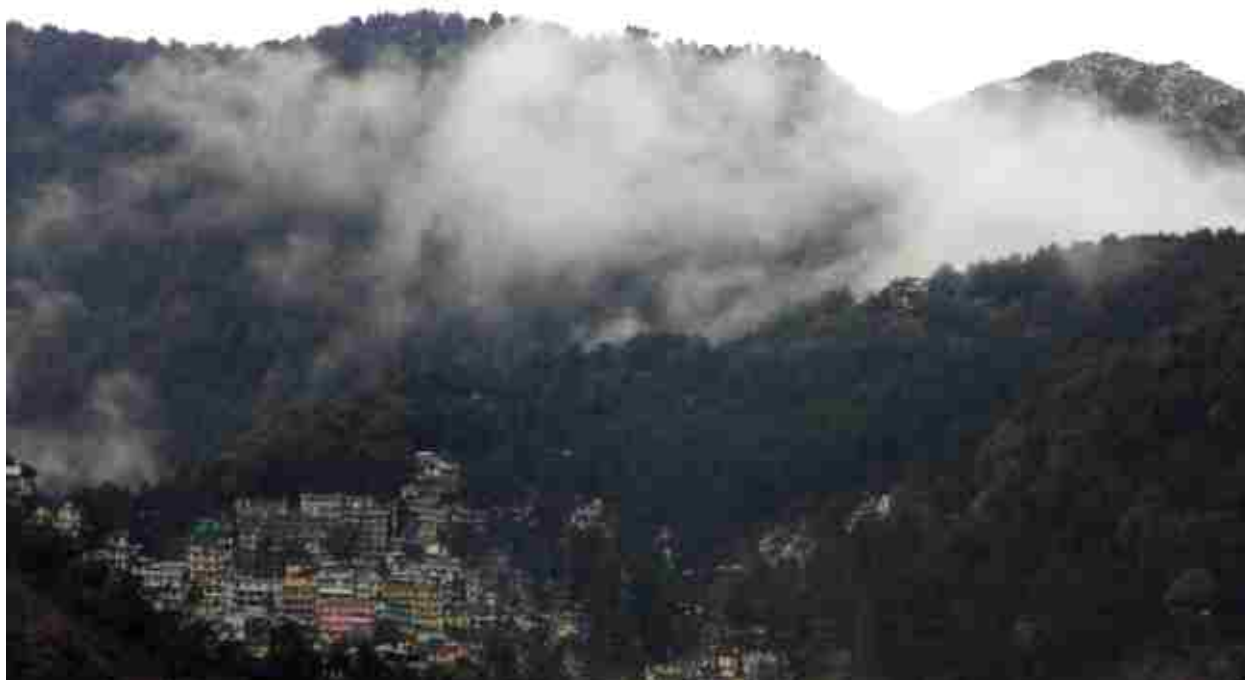
A view of McLeodganj from Indrunag, proposed site of Dhauladhar Campus of the University.

Three meetings of the Finance Committee i.e. on 11.6.2011, 10.12.2011 and 27.02.2012 were held during the year.