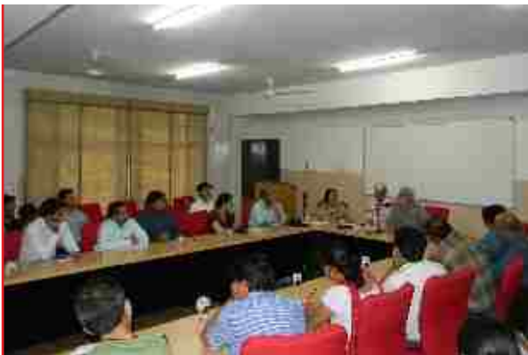
Eminent Scholars from various universities and the Sahitya Akademi in the Workshop on 'Language Teaching & Literary Scenario'