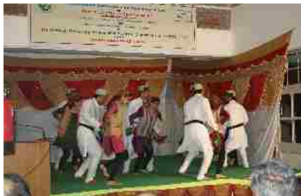
Students performing Himachali Folk Dance in Cultural Evening organised during International Conference on Sociology of Law.