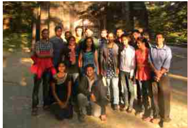
Students of the University at an excursion trip on way to McLeodganj.