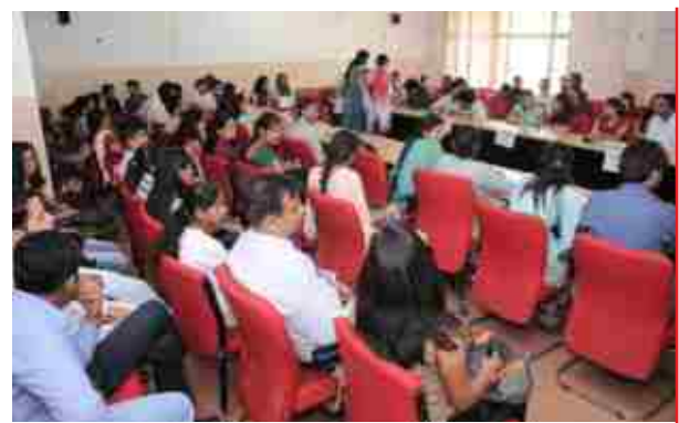
Participants and Students during Quiz Competition organised by the University.