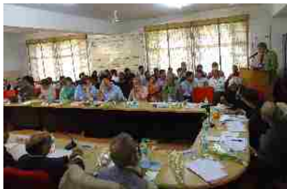
Welcome Session of International Conference on Sociology of Law is in progress.