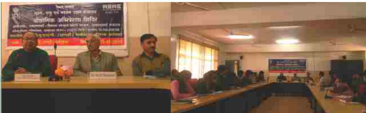
An Industrial Motivation Camp organised by Micro, Small & Medium Enterprises – Development Institute, Solan is in progress.