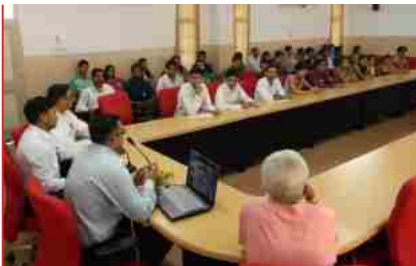
An interactive discussion on blood donation, myths and misconceptions related to blood donation is in progress.