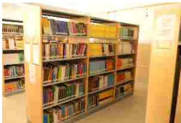
A view of Book Section of Library at Temporary Academic Block.

The Camp Office is fully functional with modular furniture and has such facilities as office of the Vice Chancellor, four chambers for senior officers of the University, fully-equipped Board Room for meetings etc, eight cubicles for office staff, store room, pantry and reception, 24 lines EPBAX, multimedia projector, photocopier, 17 PCs, 10 MBPS internet connectivity with Local Area Network (LAN) and WiFi.