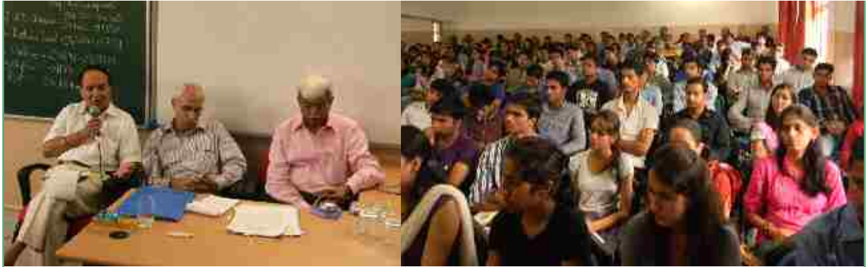
Anti-Ragging Awareness Programme of the University is in progress.

Chancellor and the second meeting took place in the Monsoon Semester on 22nd November 2011 under the Chair of the Vice Chancellor. The Committee noted with satisfaction that no incident of ragging took place.