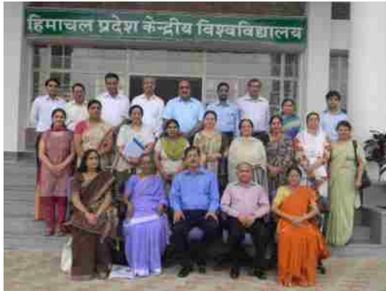
Participants of Orientation Programme in Planning and Management of Higher Education Institutions for College Principals organised by NUEPA, New Delhi in collaboration with CUHP.