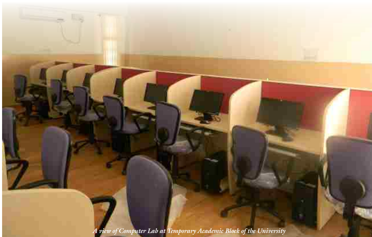
A view of Computer Lab at Temporary Academic Block of the University