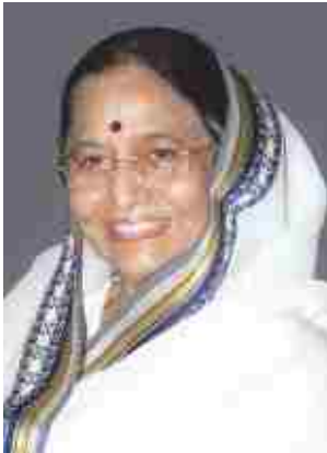
President of India Smt. Pratibha Devisingh Patil

As per the Central Universities Act 2009, the President of India is the Visitor of the University.