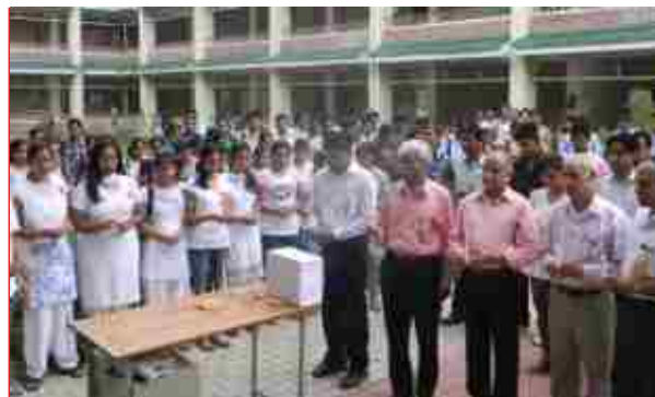
Candle lights are being lit by Faculty Members and Students on occasion of Blood Donation Camp organised by the University at TAB, Shahpur.