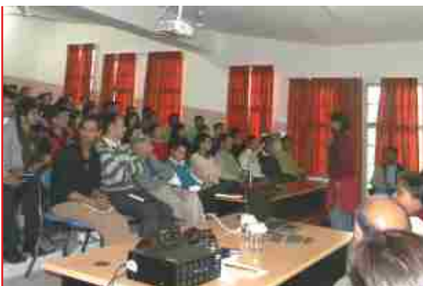
A team of 'Art of Living' conducting a workshop in the University.