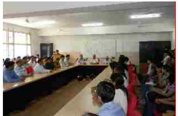
Teacher's Day 2011 celebrated by the students of the University.