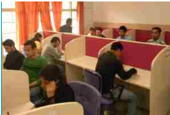
A view of Reading Section of Library at Temporary Academic Block.

The Development and Construction work at the permanent campuses of the university has not commenced as yet. It shall be taken up only after the land for the two campuses is transferred to the University. However, the University has got the Master Plans for both the campuses. Also the