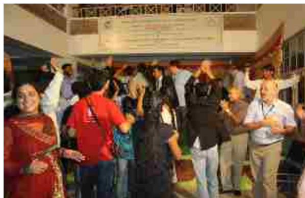
Indian and Foreign delegates and other Staff Members enjoying the cultural evening