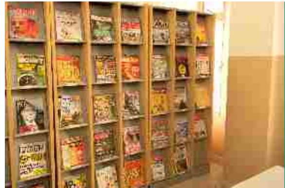
A view of Periodical Section of Library at Temporary Academic Block.

demarcation of the land and paper work/documentation for the transfer of land for both the campuses has been got completed from the Revenue Department.