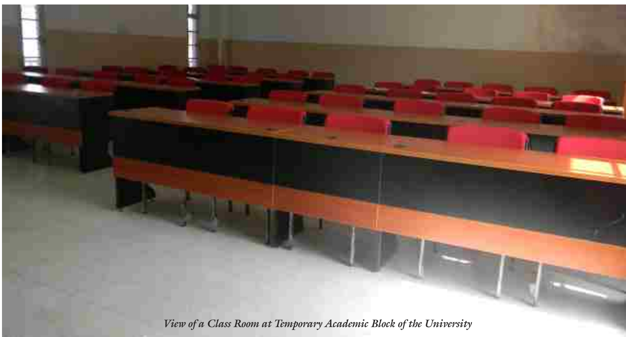
View of a Class Room at Temporary Academic Block of the University